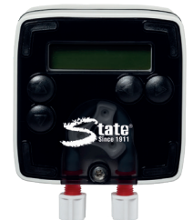
24/7™ Drain Dosing System